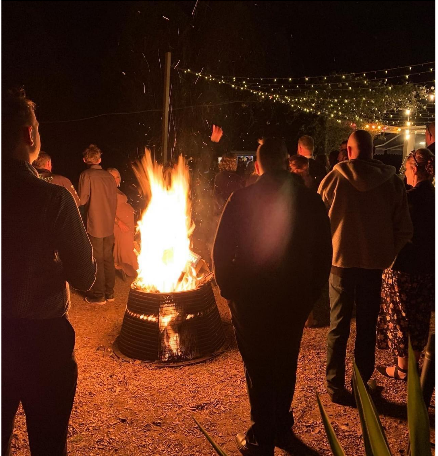
Outdoor Firepit during the Cooler Months – great for Autumn/Winter Weddings